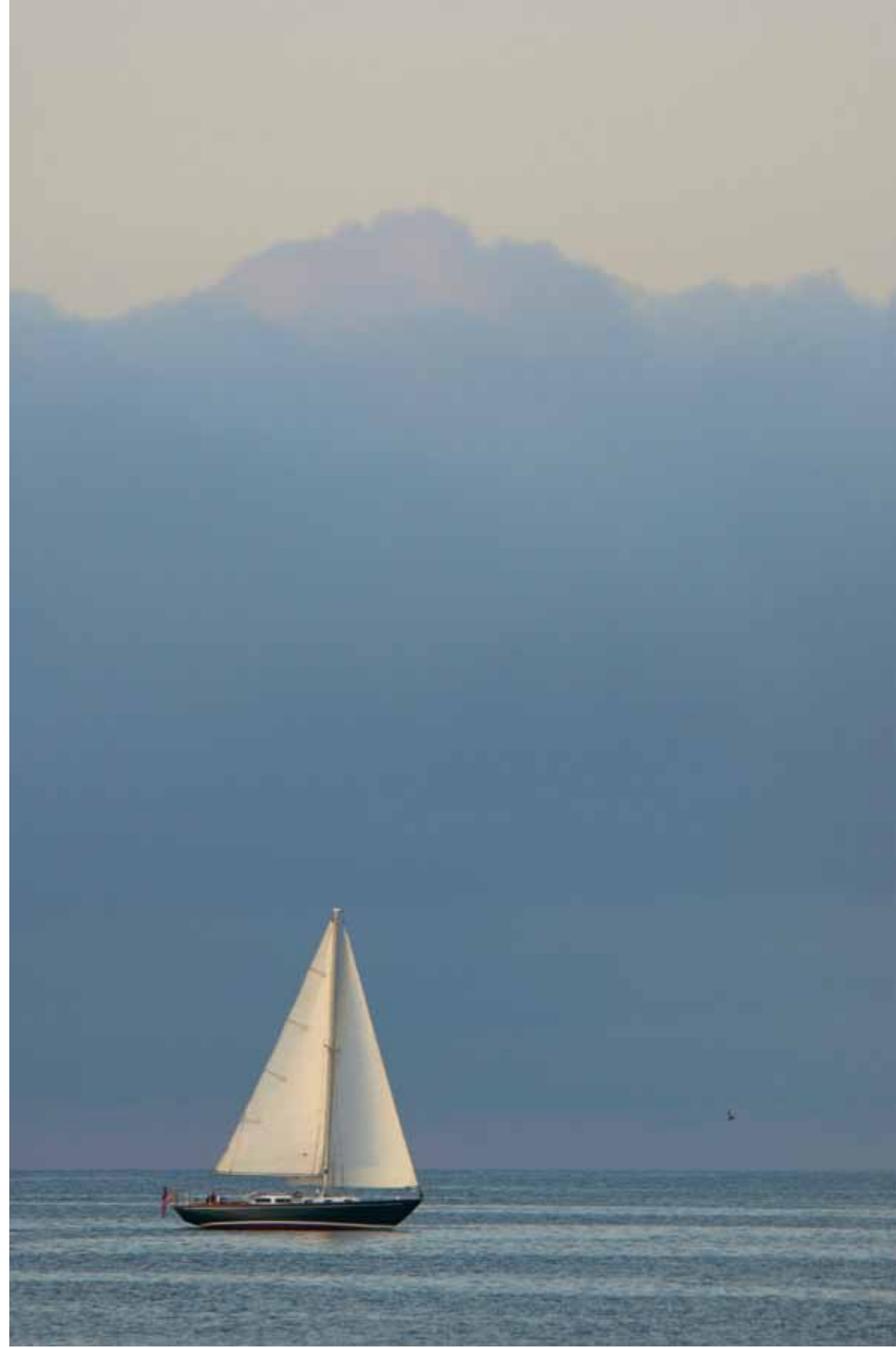
At Full Sail 36