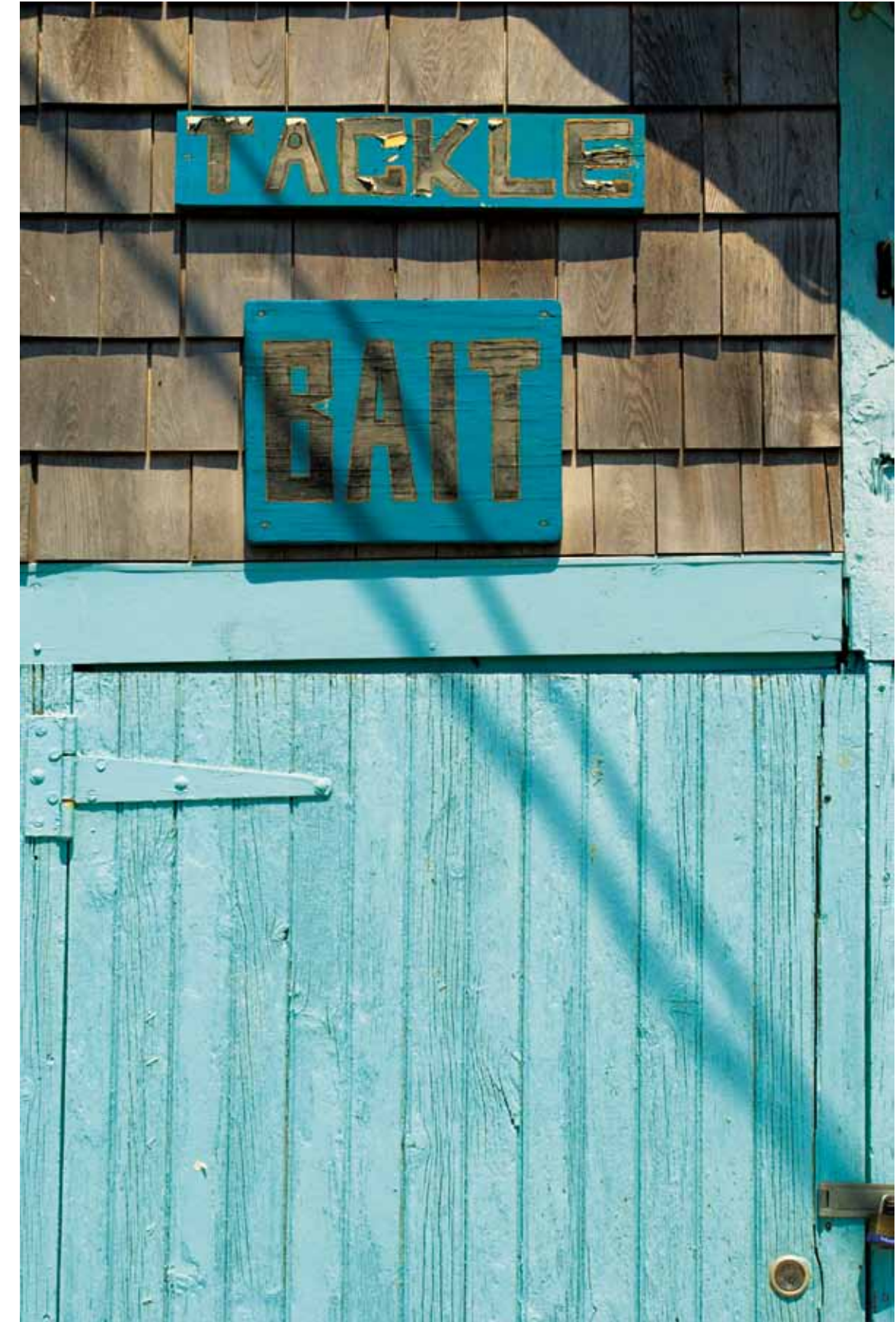
89 Bait & Tackle, Menemsha