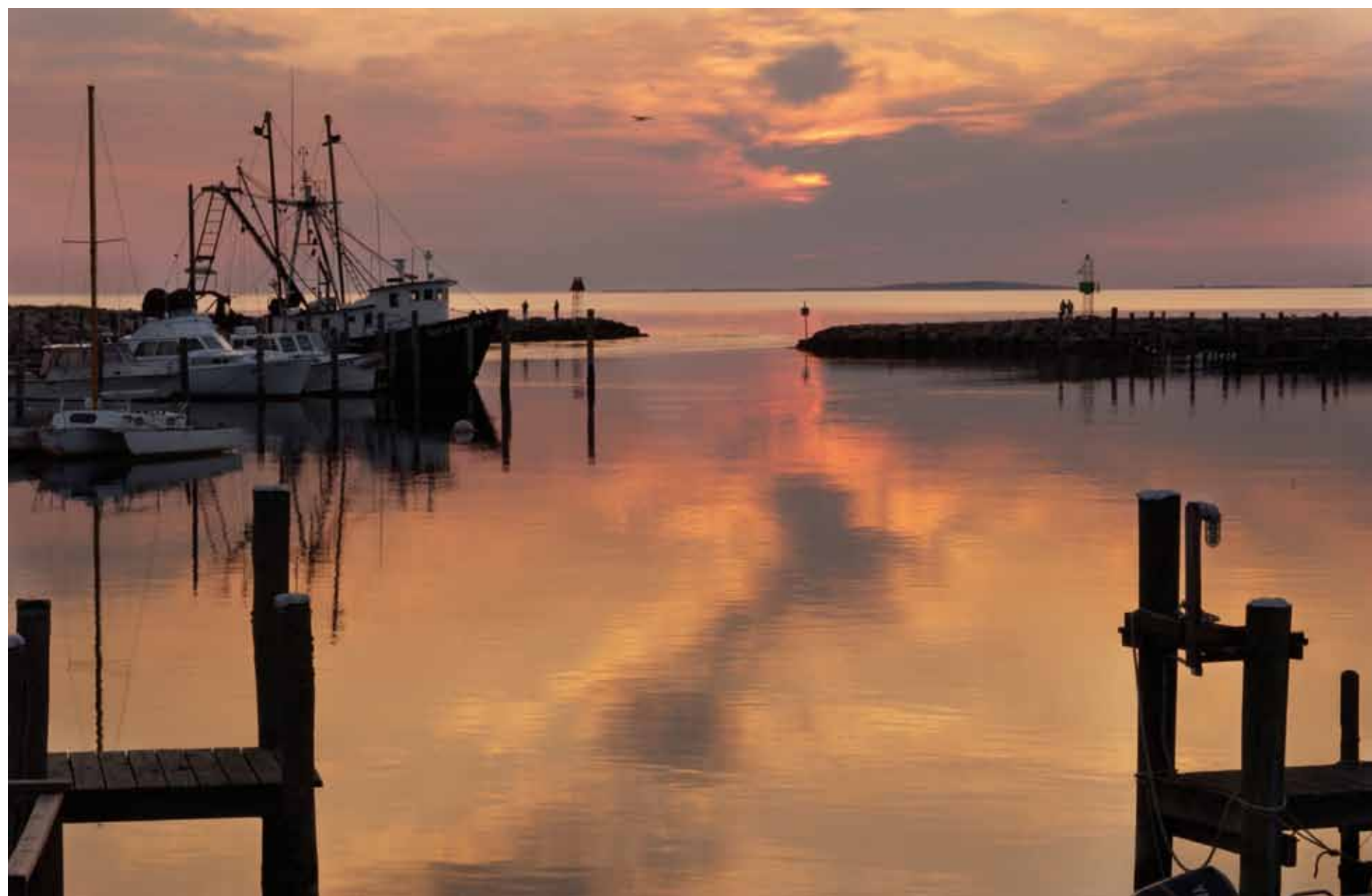
Sunset at Menemsha Harbor 14