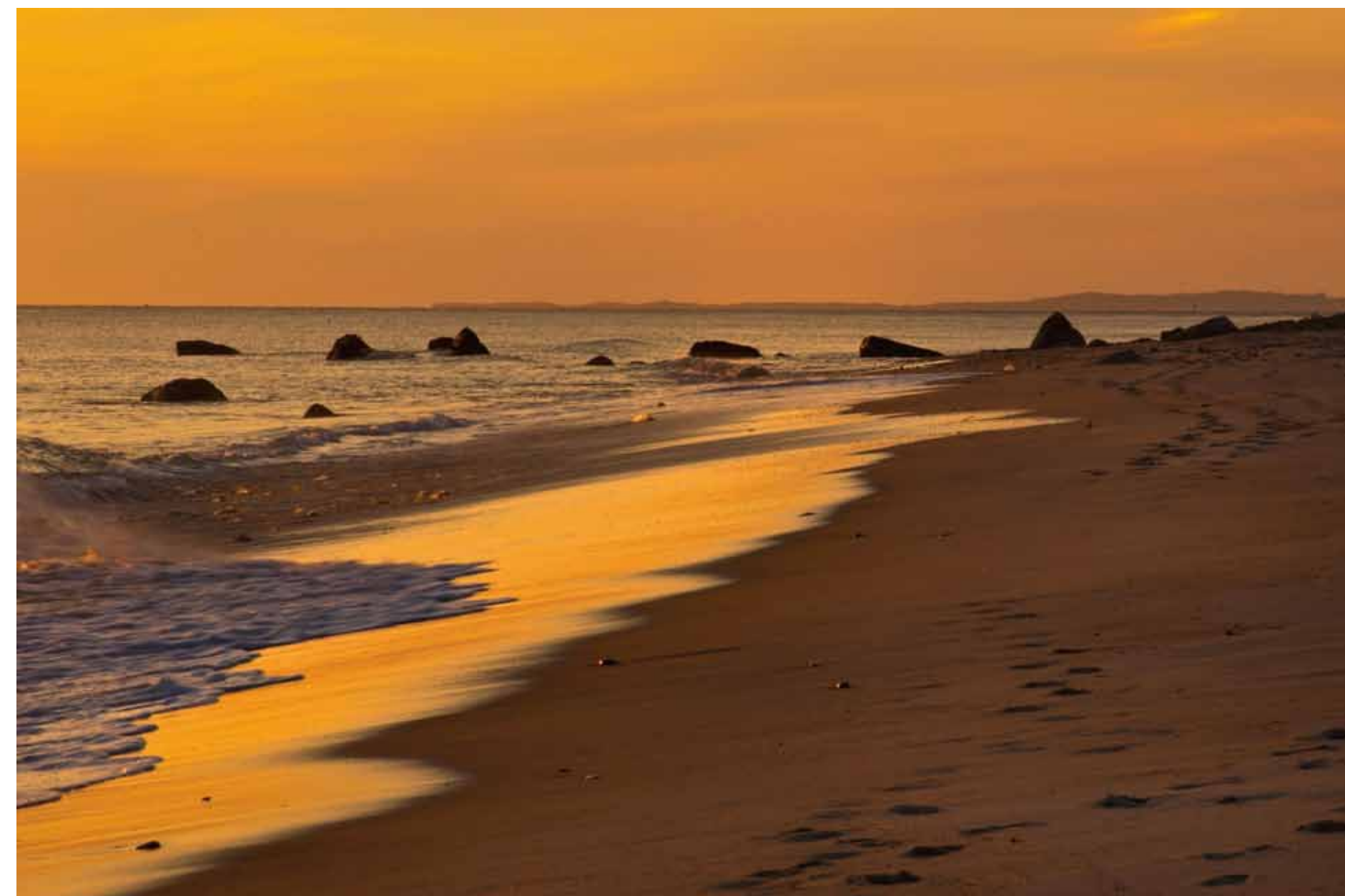
23 Elizabeth Islands, From Aquinnah