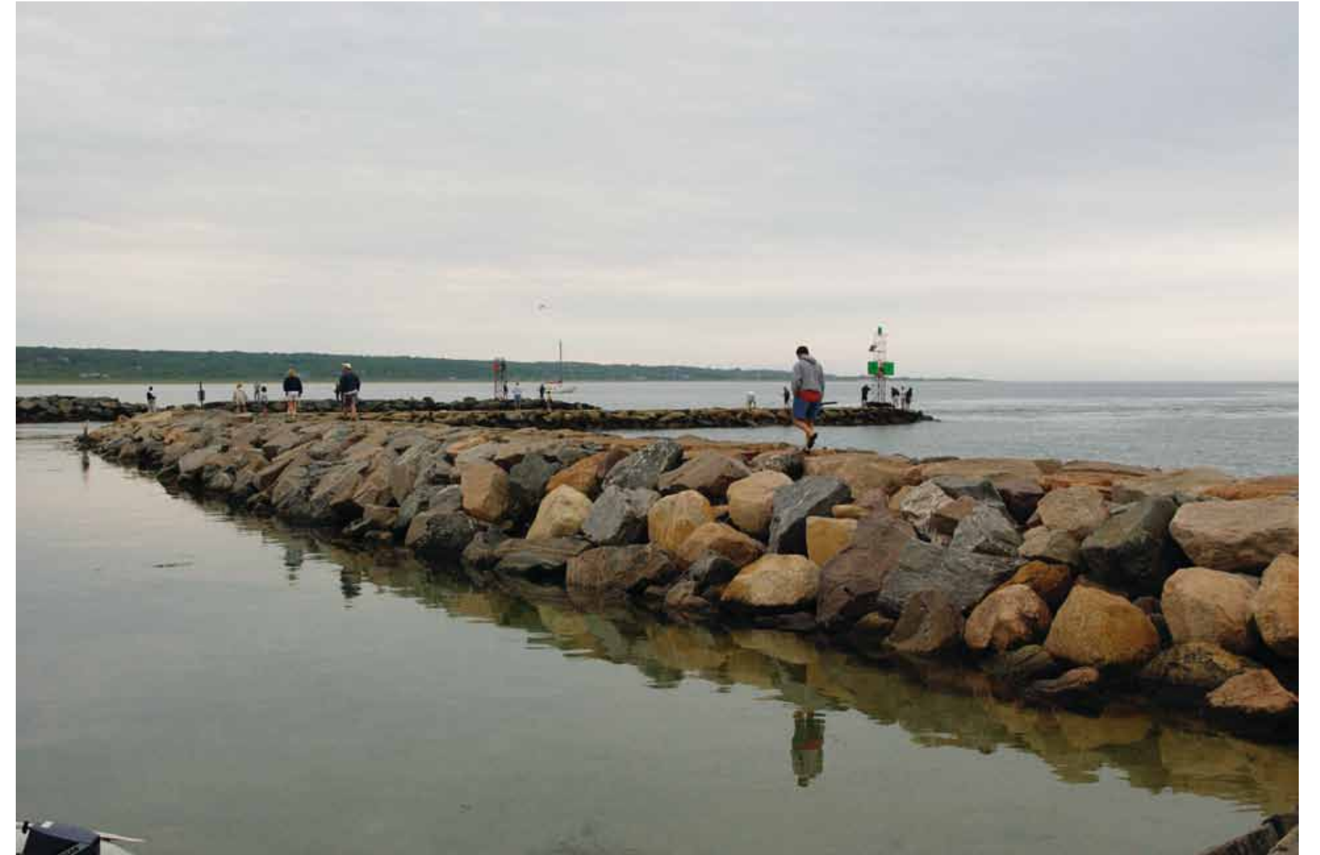
77 Menemsha Bight