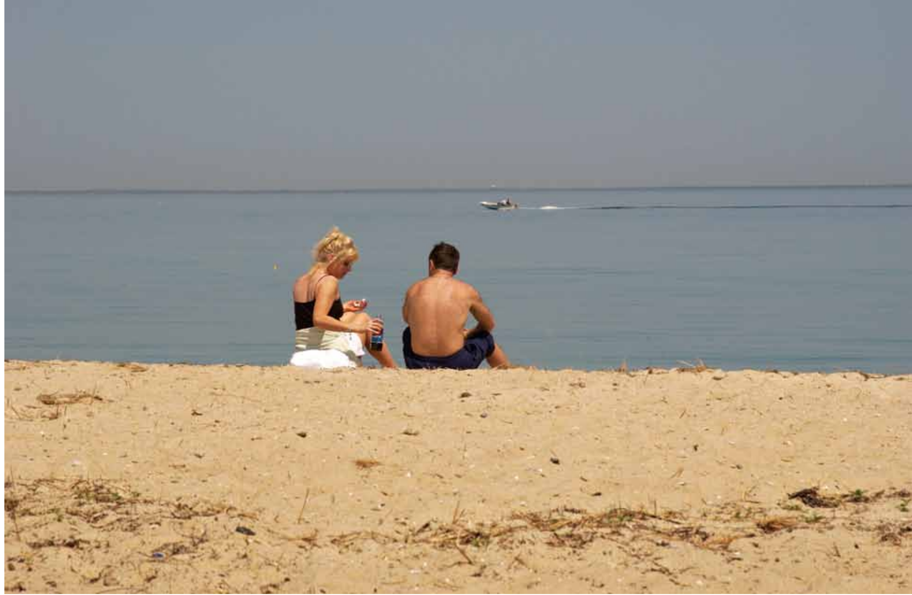
Sharing, State Beach, Oak Bluffs 84