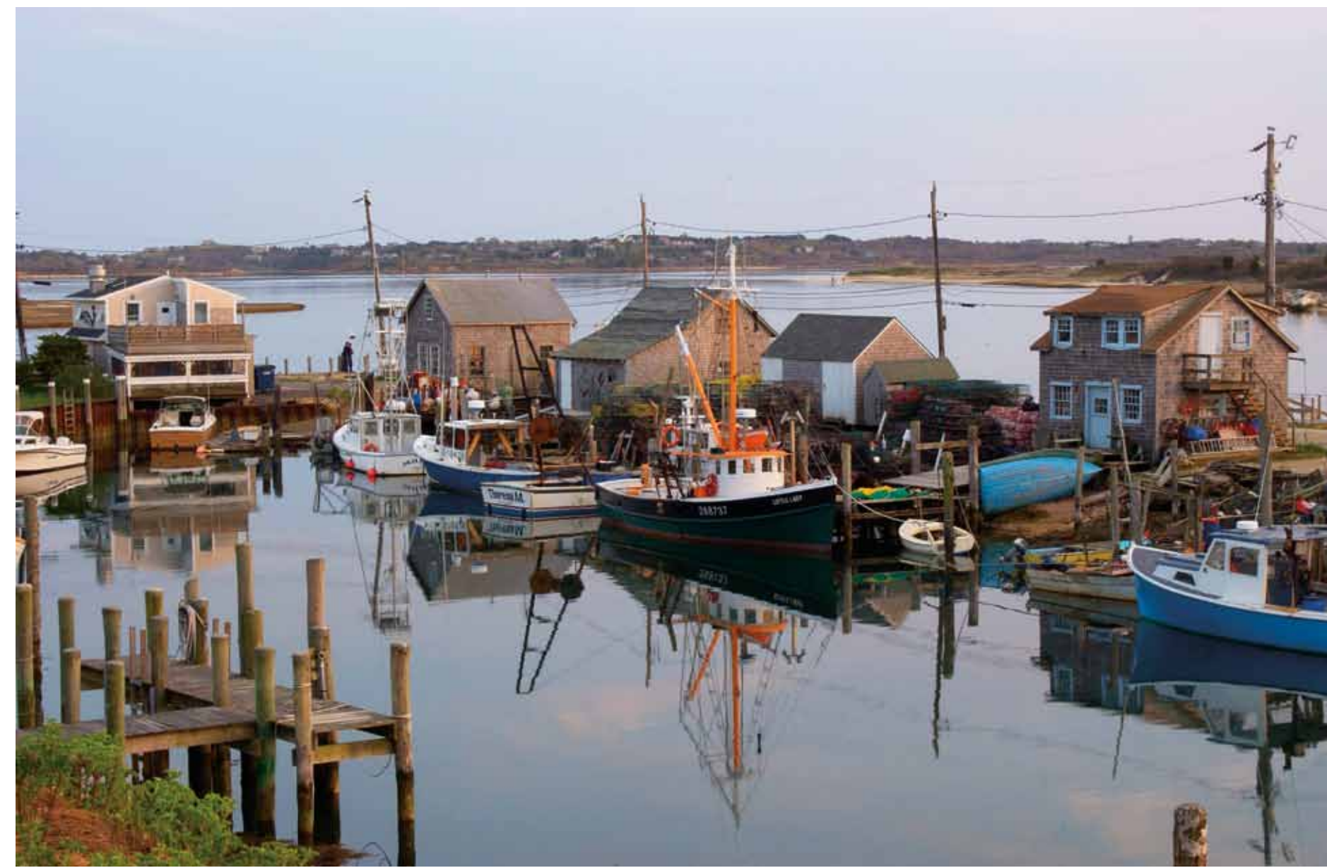
15 Menemsha Basin