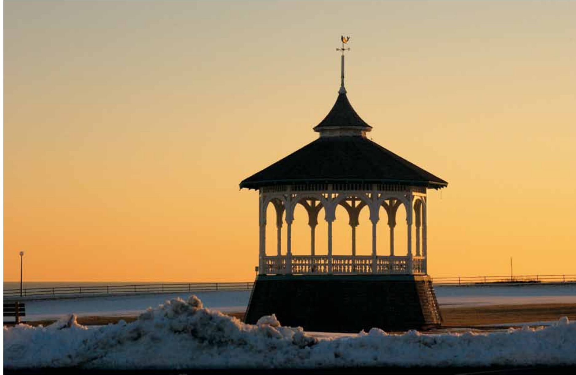
Ocean Park Gazebo, Oak Bluffs 20