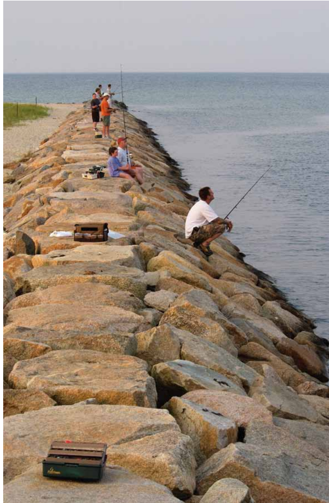
The Breakwater, Menemsha 76