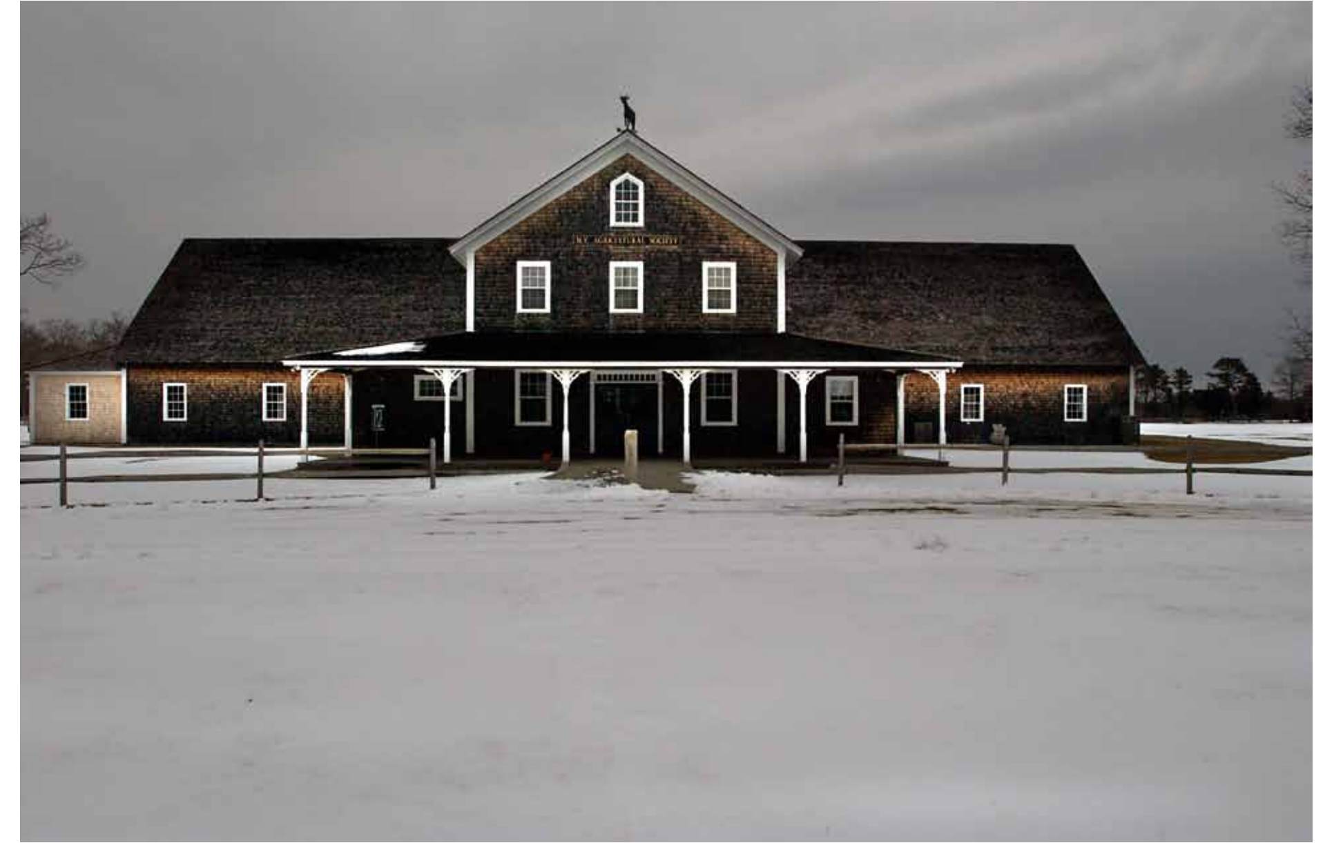
21 Agricultural Hall, West Tisbury