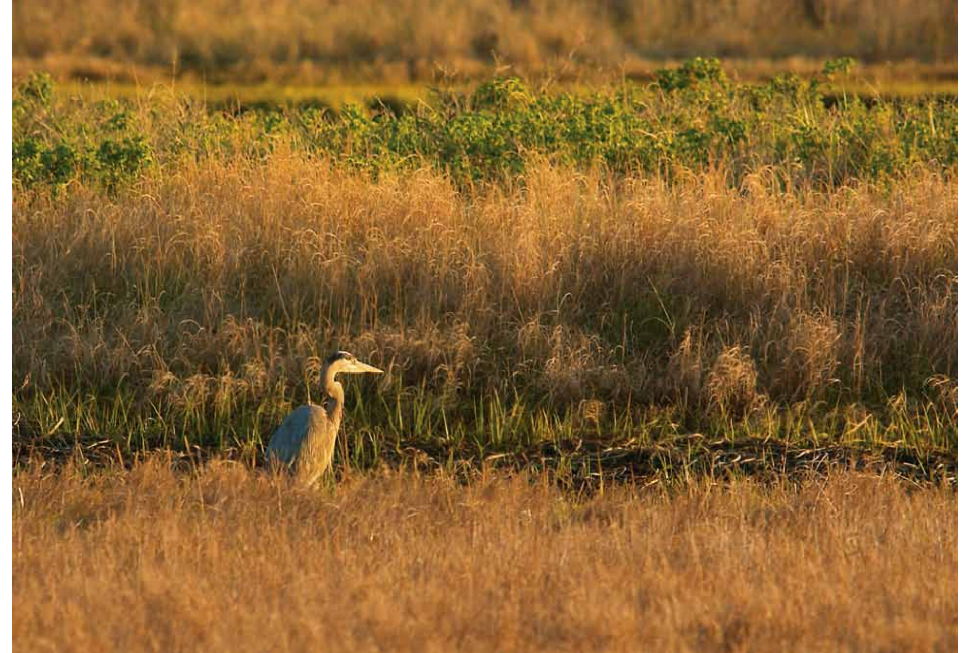
63 The Great Blue Heron, West Tisbury