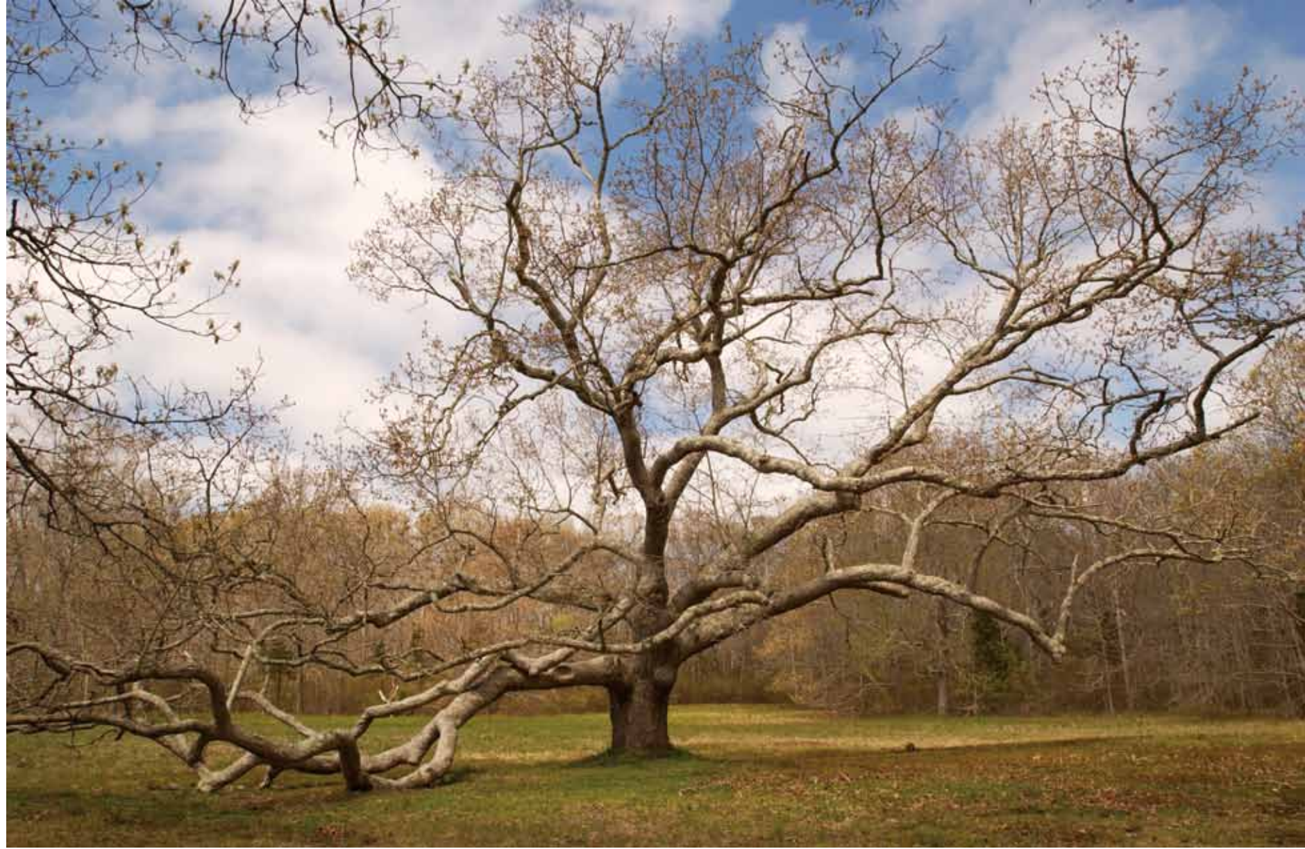
The Old Oak Tree, Spring, West Tisbury 12