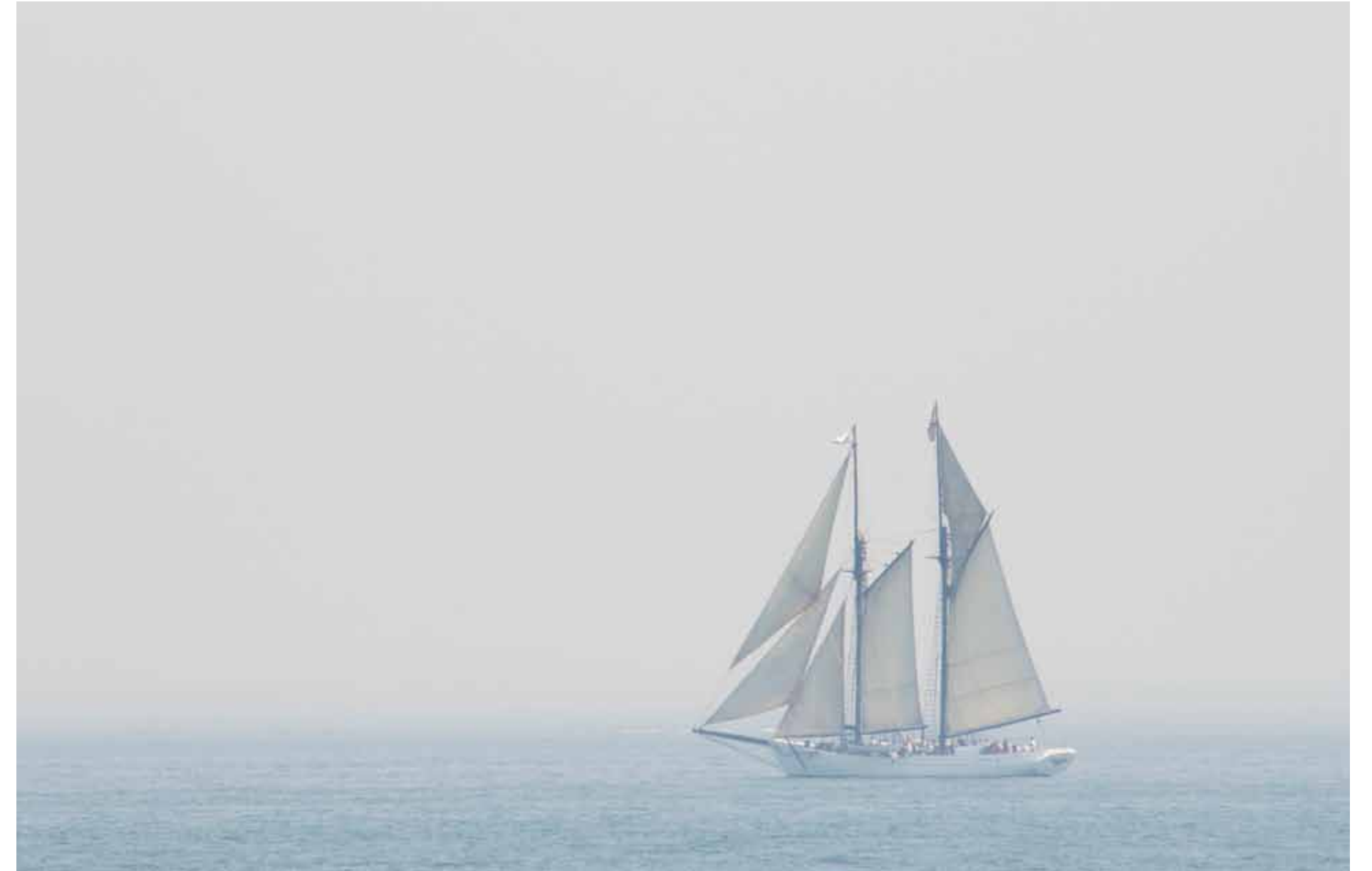
27 Tall Ship "Alabama" Sailing Off West Chop