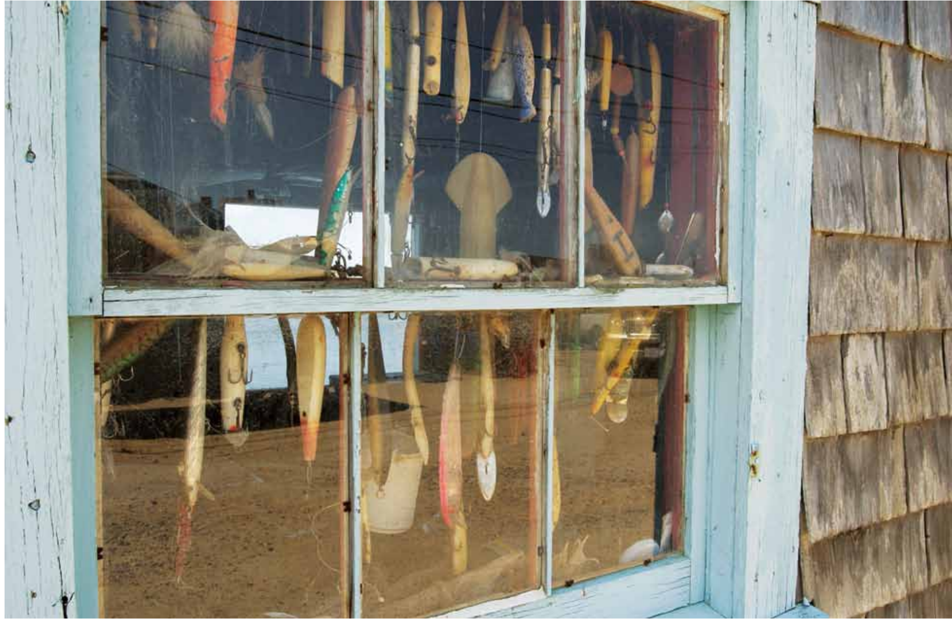
Fisherman's View, Menemsha 88