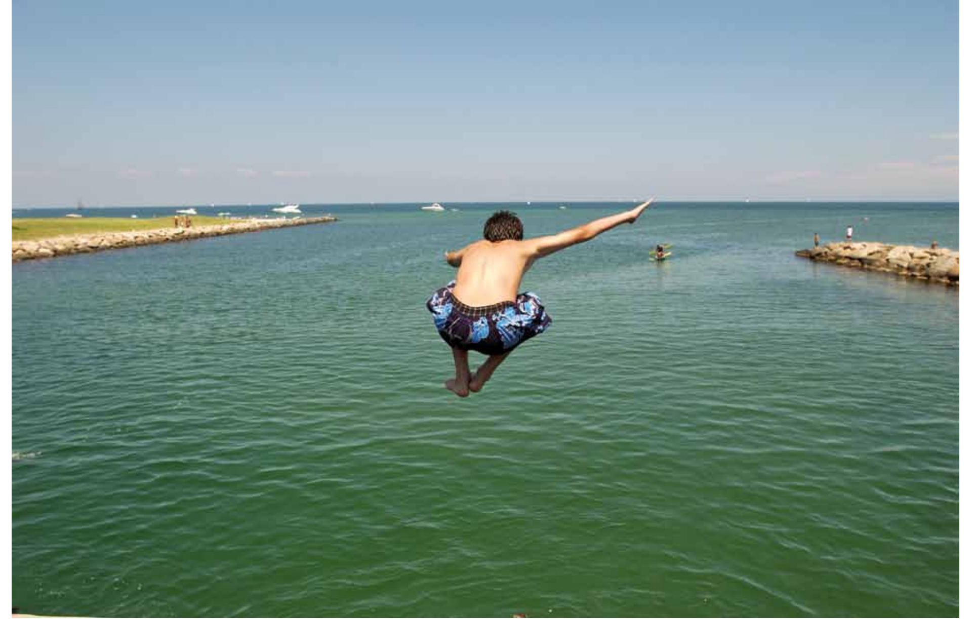
85 Summer Tradition, Memorial Bridge, Oak Bluffs