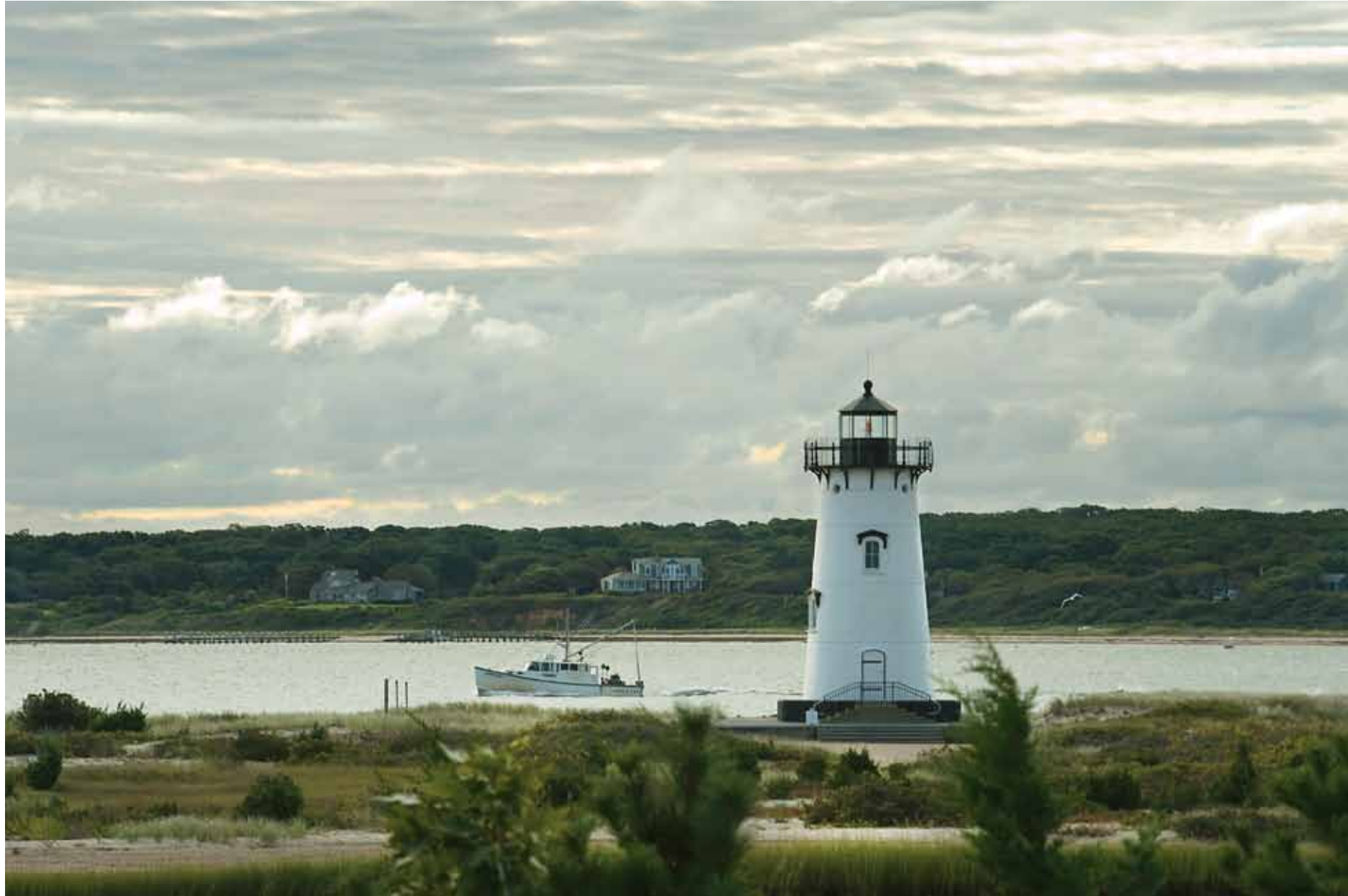
Rounding the Point, Edgartown 62