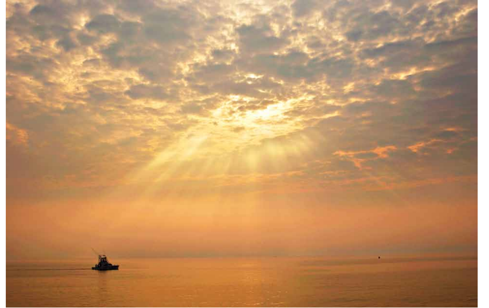
37 Heading Out, Oaks Bluffs