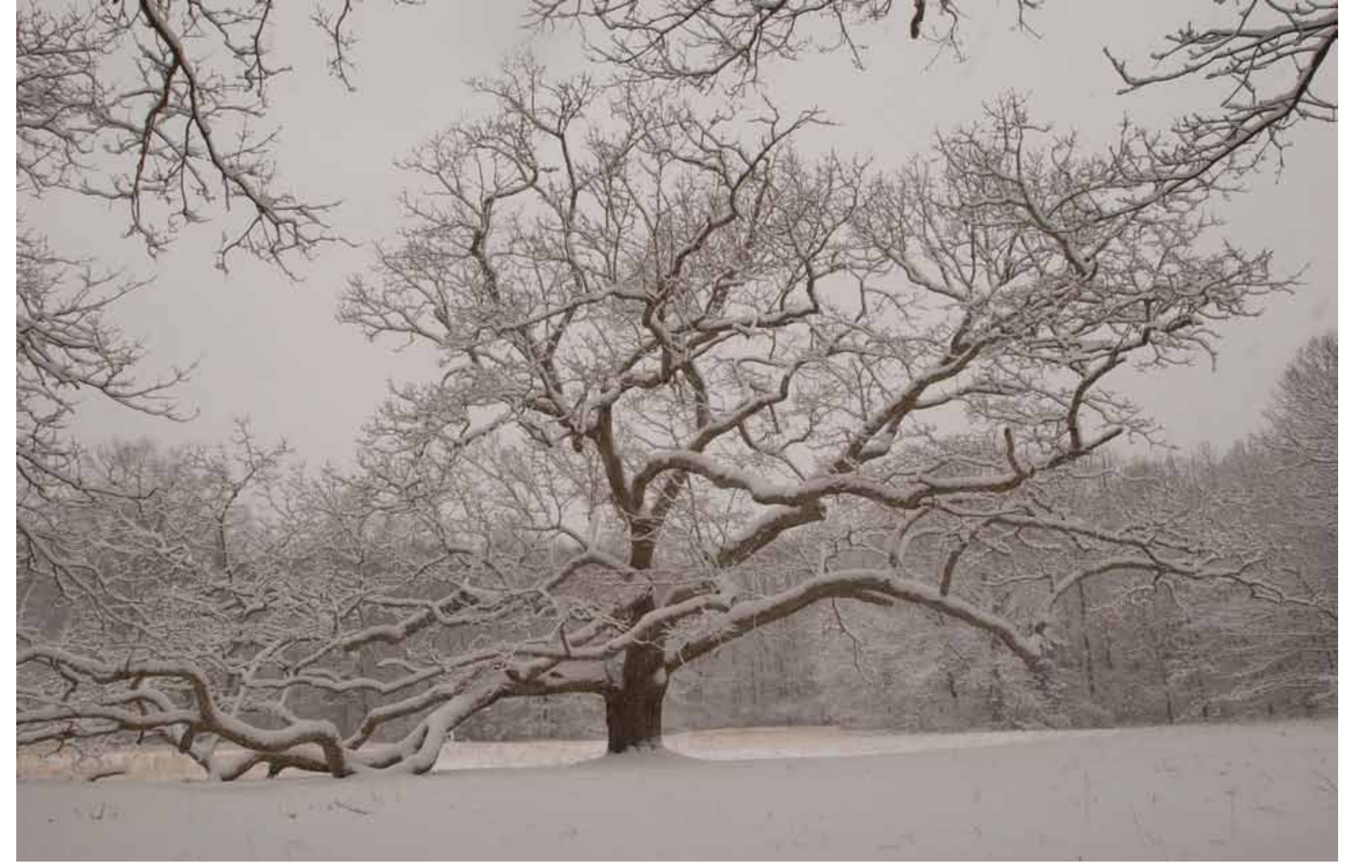
13 The Old Oak Tree, Winter, West Tisbury